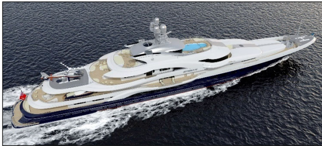
100m motoryacht Attessa IV , with a four-fin Naiad stabilizer system and DATUM AtRest controls.

Effective roll damping of a vessel not making headway, such as when at anchor or adrift, has been a persistent motion control problem. As marinas become increasingly crowded and slips more difficult to obtain, passengers and crew are more frequently aboard under anchored or moored conditions. Harbors, being busy and relatively shallow, often generate wave conditions that cause significant rolling, especially when the wave period nearly matches the vessel's