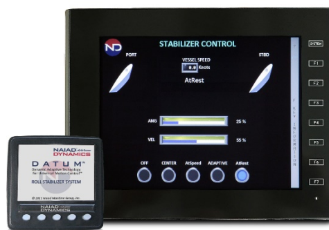
DATUM™ graphical display panel options, each with intuitive multi-page display screens.