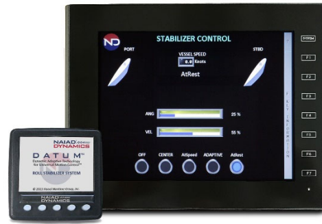
DATUM™ graphical display panel options, each with intuitive multi-page display screens.