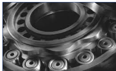
Internal Galaxie and Cycloidal Drive Gearing