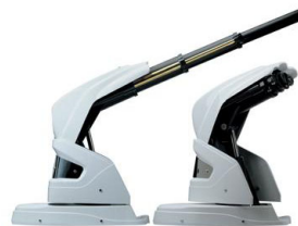
Deck Crane / Davit