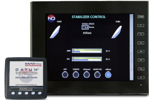
DATUM™ graphical display panel options, each with intuitive multi-page display screens.

Naiad Dynamics stands behind every system sold with its superb Limited Warranty. NAIAD® products are supported worldwide by our seven sales and service centers and mobile fleet, and by our comprehensive Authorized Dealer Network with locations in key regions for fastest response and guaranteed satisfaction. Spare parts are usually in-stock and ship within 24 hours, and our state-of-the-art in-house manufacturing facility ensures quick turnaround on parts throughout the life of the system.