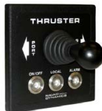
Spring Centered or Put & Stay

Single-stage or fully variable (proportional) controls. Proportional configuration permits the output of the thruster to be throttled by the operator and features a PLC (Programmable Logic Controller) specifically programmed for the application. Controls are housed in a single, durable enclosure for ease of installation. Easily fitted with numerous joystick controls. Most Naiad thrusters are powered by a Naiad Integrated Hydraulic System (IHS). The PLC is easily configured to control many ancillary hydraulic shipboard systems.