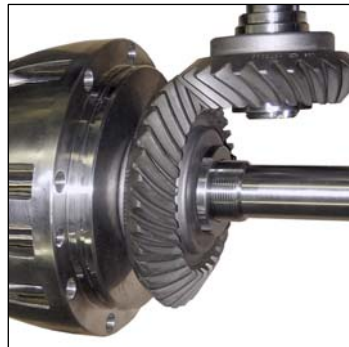
Precision Match Ground Spiral Bevel Gears