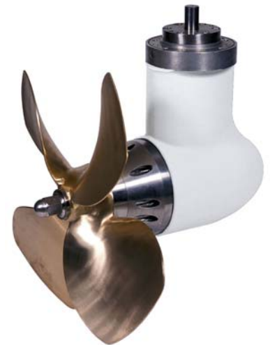
Four Blade Kaplan Style Propeller