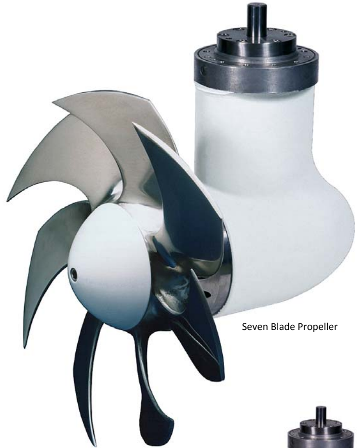
Seven Blade Propeller