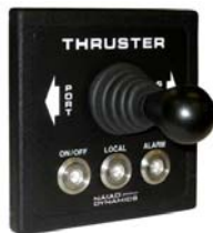
Spring Centered or Put & Stay

Single-stage or fully variable (proportional) controls. Proportional configuration permits the output of the thruster to be throttled by the operator and features a PLC (Programmable Logic Controller) specifically programmed for the application. Controls are housed in a single, durable enclosure for ease of installation. Easily fitted with numerous joystick controls. Most NAIAD thrusters are powered by a Naiad Integrated Hydraulic System (IHS). The PLC is easily configured to control many ancillary hydraulic shipboard systems.